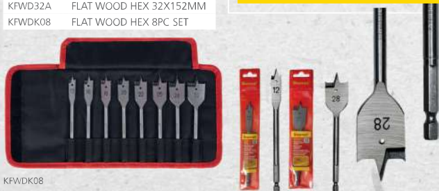
KFWDK08 FLAT WOOD HEX 8PC SET