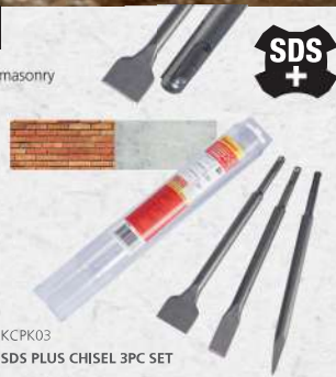
KCPK03 SDS PLUS CHISEL 3PC SET • Wide chisel 250mm • Flat chisel 250mm • Pointed chisel 250mm